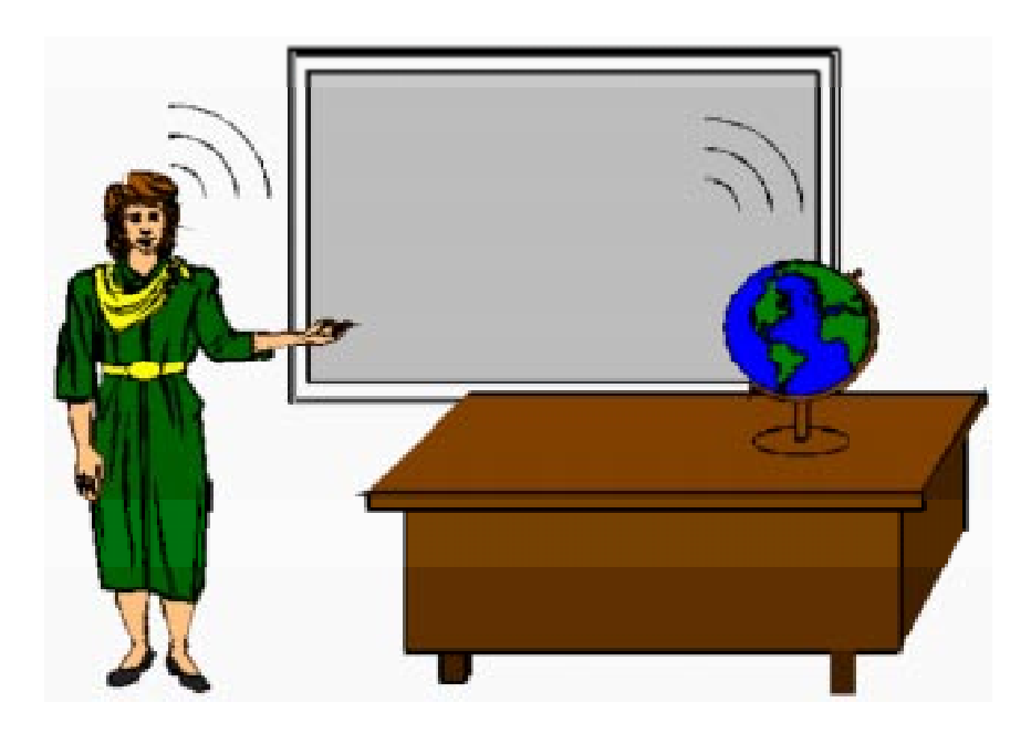
Figure 1. An MPEG4 scene with audio and video objects